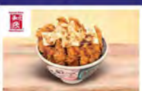
Watami Japanese Dining 30% OFF Cheesy Chicken Katsu Don