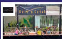
Bait N Catch 30% OFF Prawning