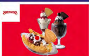
Swensen's Buy 2 Sundaes and Get 1 Free