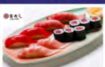
Tomi Sushi 30% OFF Maguro Zassai