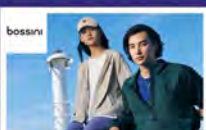
Bossini 30% OFF All Regular Items