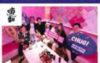
HaveFun Karaoke 40% OFF All Karaoke Room Bookings