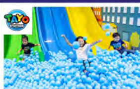
Tayo Station Buy 2 Child Tickets and Get 1 Free