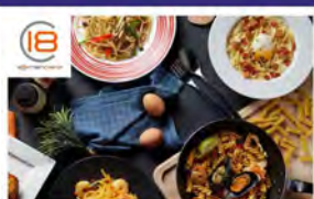
Eighteen Chefs Buy 2 Mains (Meat Lover / Fish Lover) and Get 1 Free Pasta