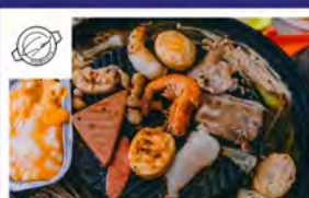
Siam Square Mookata $1 for a Plate of Pork/Chicken (Max 3)