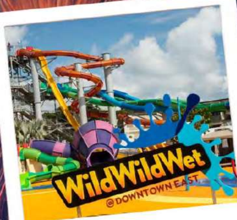
20% off Wild Wild Wet