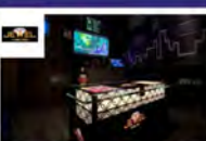
Jewel Music Box 30% OFF Admission including Free Flow Soft Drinks & Snacks