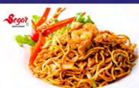
Segar Restaurant 1-for-1 Selected Rice and Noodles