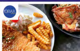
OBAR Live House Buy 2 À la carte Mains and Get 1 Free