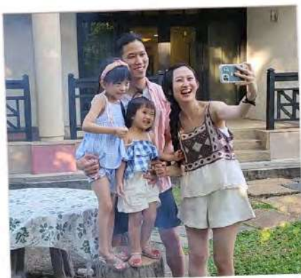
Suite with BBQ pit

Planning a celebration / BBQ gathering? Stay at our cosy 2-bedroom Executive Suites.