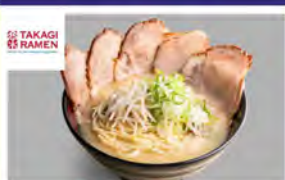
Takagi Ramen Buy 2 Ramen from Shoyu Series and Get 1 Free