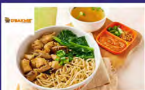
D'Bakmie Buy 2 Bowls of Bakmie and Get 1 Free