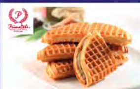
PrimaDéli Buy 2 Waffles and Get 1 Free Plain Waffle