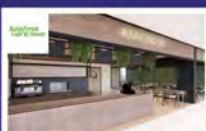
Rainforest Café 30% OFF Total Bill