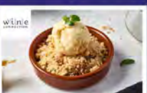
Wine Connection Free Dessert with À la carte Dine-in Purchase

Valid from 6 August 2024 to 29 July 2025, excluding eve of and on Public Holidays of Christmas, New Year, and Chinese New Year. Valid NTUC membership card must be presented at point of sale to enjoy these privileges. Individual Terms & Conditions apply. Refer to www.downtowneast.com.sg for full details.