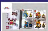
RainbowHouse 30% OFF Education Mini Blocks