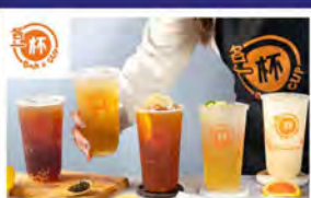
Each-A-Cup $2 Medium Size Milk Tea