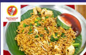
Springleaf Prata Place 1-for-1 Maggi Goreng