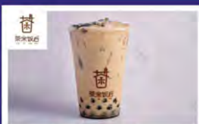
Cha Yu Fan Hou 1-for-1 Medium Size Milk Tea