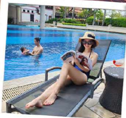
Enjoy poolside bliss