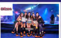
Hi Roller Free Skates Rental