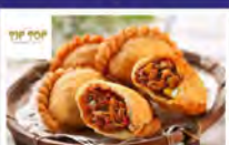
Tip Top Curry Puff Free Curry Chicken/Sardine Puff with every 4 Puffs Purchased