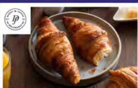
Délifrance Buy 2 Heritage French Butter Croissants and Get 1 Free